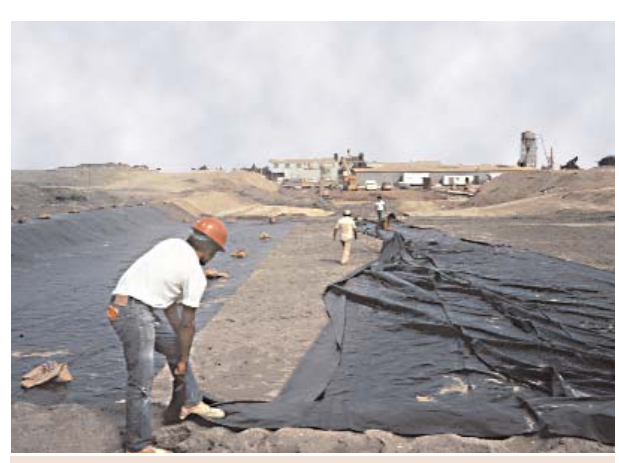
Synthetic materials can be used as landfill liners to prevent contamination of groundwater resources.

Waste is placed directly above the leachate collection system in layers. Delivered waste is placed on the working face that is maintained as small as possible to control odors and vectors. Heavy steel-wheeled compactors move the waste into the working face to reduce the waste's volume. At the end of each