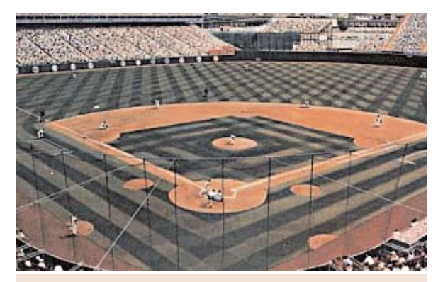
Mile High Stadium near Denver, Colorado is an example of a Category 3 post-closure use.