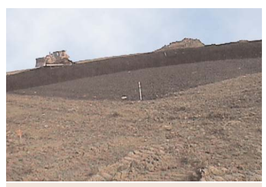
Researchers at this bioreactor landfill are testing the use of biocovers as an alternative cap system.

Another promising innovation is the use of biocovers (composted yard waste used as final cover) to further reduce air emissions at landfills. The benefits of biocovers are that air emissions of methane and other organic compounds are oxidized and destroyed in the biologically active compost. Research has shown that biocovers are effective for controlling air emissions when used: