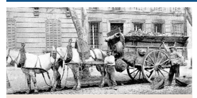
Early efforts at waste collection in cities consisted of horse-drawn wagons.

The first federal legislation addressing solid waste management was the Solid Waste Disposal Act of 1965 (SWDA) that created a national office of solid waste. By the mid-1970s, all states had some type of solid waste management regulations. However, the contents of these regulations varied widely. During this time, many state laws banned the open burning of waste at dumps and began replacing them with sanitary landfills. In addition, some states required disposal facilities to obtain permits and meet minimal design and operational standards.