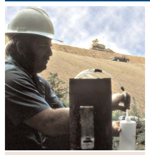
Testing of water samples in groundwater monitoring wells at modern landfills ensures that leachate collection systems are working correctly to protect public health and the environment.

most cases, contaminant concentrations in leachate from modern landfills are one to two orders of magnitude less compared to older landfills. Moreover, EPA research anticipates that the quality of leachate will continue to show improvement over time as the existing public database for modern landfills increases.