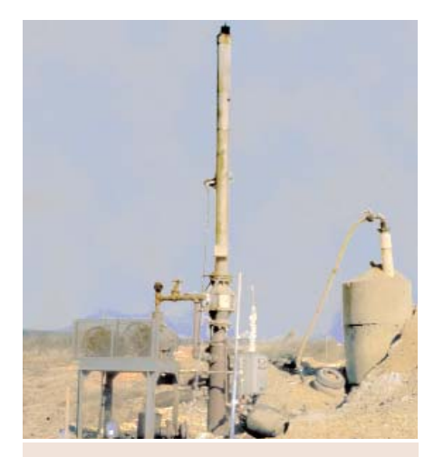
Devices used to combust gas at modern landfills have more than a 99 percent destruction efficiency rate for methane and a 98 percent rate for other gases.

As noted earlier, collected landfill gas can be used to generate electricity or heat for powering industrial facilities, providing lighting and temperature control to homes and businesses, or as a fuel for use in vehicles. EPA's latest data show that there are more than 375 operational gas-to-energy projects in 38 states. These projects collect some 74 billion cubic feet of landfill gas and generate 9 billion kilowatt hours of electricity per year. The annual environmental benefits from current landfill gas-to-energy projects are equivalent to: