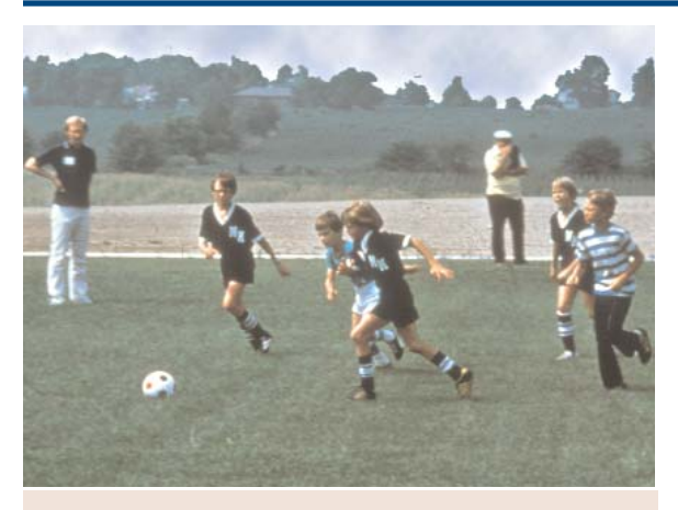
Category 2 uses for closed landfills include chidren's playgrounds such as this soccer field.

Category 2 uses are more intensive and are typically characterized by not having major structures, but may have utilities, light structures, or paving. Examples are: