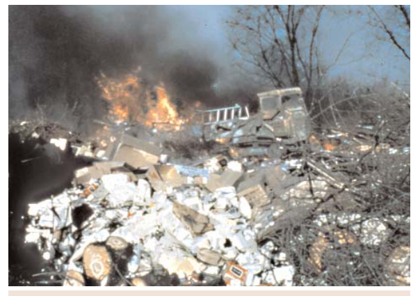
Old landfills used open burning to reduce space, but also created air pollution.

In less than 30 years, landfills changed from little more then holes in the ground to highly engineered, state-of-the-art containment systems requiring large capital expenditures. Typically, older landfills were designed by excavating a hole or trench, filling the excavation with trash, and covering the trash with soil. In most instances, the waste was placed directly on the underlying soils without a barrier or containment layer (liner) that prevented leachate (water percolating through the waste and picking up contaminants) from moving out of the landfill and contaminating groundwater (6).