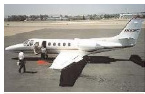
Palomar Airport in is partially built on a Category 1 closed landfill.