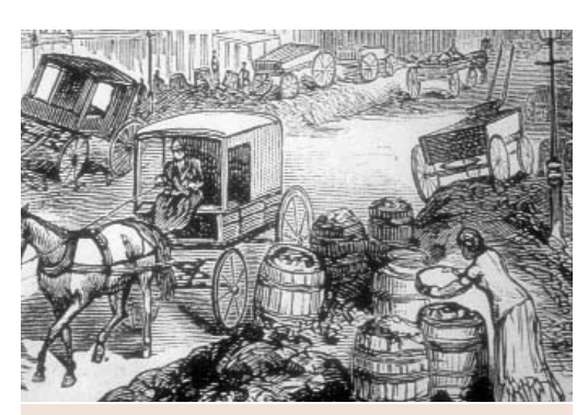
In the late 1860s, garbage was placed in leaking barrels on the street edge and picked through by salvagers and otherwise left for animals.

In 1935, the precursor to the modern landfill was started in California where waste was thrown into a hole in the ground that was periodically covered with dirt. The American Society of Civil Engineers in 1959 published the first guidelines for a "sanitary landfill" that suggested compacting waste and covering it with a layer of soil each day to reduce odors and control rodents.