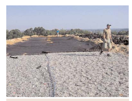
Researchers at this bioreactor landfill are testing the liquids distribution system using permeable blankets built into the lifts.